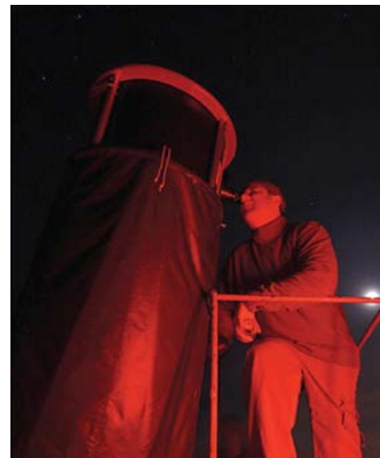
The 20" Obsession at Beaver Meadow is the largest public telescope in WNY

To reach the Observatory, take route 400 to East Aurora rte. 20A. Turn left on 20A and continue 10.8 miles to rte. 77. Turn right on 77 and continue south 6.9 miles to Welch Rd. Turn left onto Welch Rd. The parking lot for Beaver Meadow Nature Center is on your right 1/4 mile down the road. The observatory is the building closest to the parking lot.