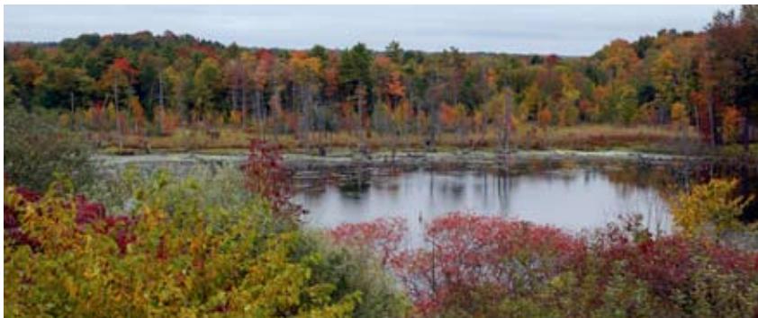
The BAA Observatory is located under the dark rural skies and spectacular scenery of Beaver Meadow Nature Center in North Java, NY

Whether you own a telescope, binoculars, or just love to look up at the night sky the BAA has a universe of experience to offer. To become a BAA member complete the membership application below.