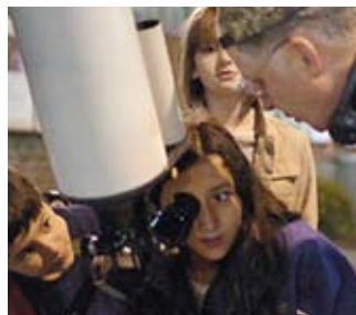
Sidewalk astronomy on Elmwood Avenue

The Buffalo Astronomical Association is an organization composed of people from all walks of life who share in common a love for the wonders of the universe. Our goal is the preservation of astronomy on the amateur level and to this end we pledge our talents and resources.